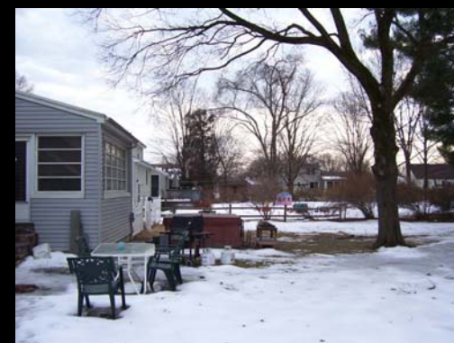
Photo-Pompton Back Yard