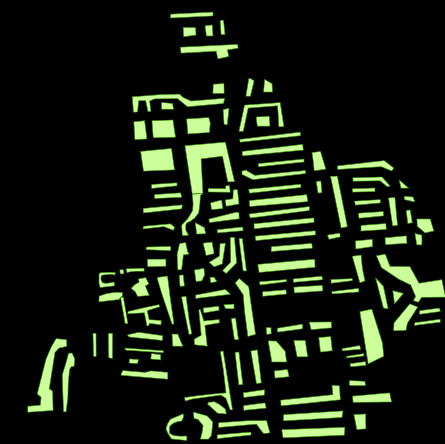
Pompton Small Patch Pattern