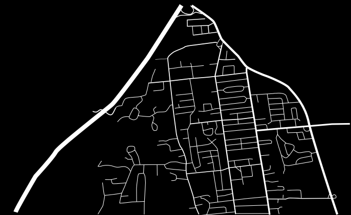
Pompton Rectilinear Pattern