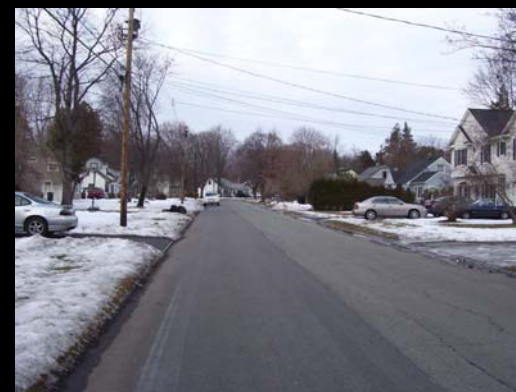
Photo-Pompton Residential Street